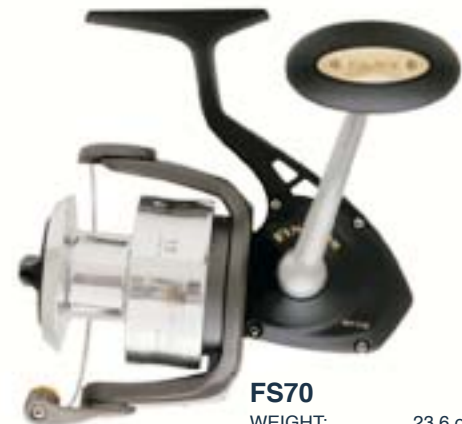
FS70 WEIGHT: 23.6 oz. RETRIEVE RATE: 35.0 in.