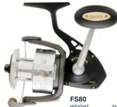
FS80 WEIGHT: 24.4 oz. RETRIEVE RATE: 37.0 in.