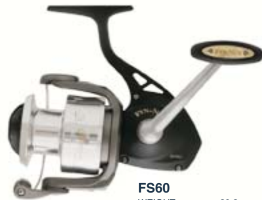
FS60 WEIGHT: 20.2 oz. RETRIEVE RATE: 32.0 in.