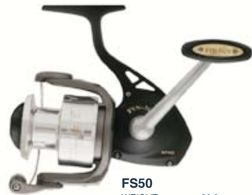
FS50 WEIGHT: 20.0 oz. RETRIEVE RATE: 30.0 in.